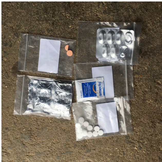
FIGURE 2. “Mixed medicine” taken at home by a confirmed enteric fever patient. This figure appears in color at www.ajtmh.org .

Treating individual symptoms required a mix of different medicines, generally including a combination of: 1) paracetamol, 2) antidiarrheals, 3) one or two antibiotics, 4) vitamins, 5) anticold or cough medicine, 6) antacids, and 7) anti-inflammatory medicines or steroids (Figure 2). At drug outlets, these pills were often removed from blisters and prepackaged in single plastic bags. Also physicians frequently prescribed combinations of at least five different medicines. These mixed medicine bags were referred to as “ thnam psom ”, or “unknown