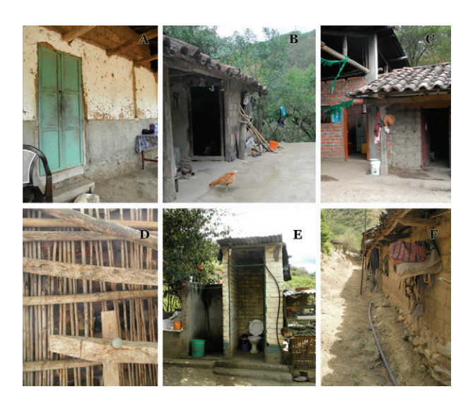
Fig. 1: positive deviants have implemented different solutions to deter the natural decay of their houses and reorganise their living environments. Improvements applied to traditional adobe structures include: cement plastering (A), cement floors in the porch area (B), partial additions constructed with bricks (C), carrizo ceiling and chahuarquero beams (D), latrines and water tanks (E) and rock foundations (F).

Traditional forms of funding through family loans and animal commerce can impact house construction time. One of the participants identified this situation as problematic because it is a result of the limited resources available to them on a regular basis. Two years ago, he built the walls of a new room for his house with an elevated zinc roof that leaves a considerable gap between the roof and wall. He had not finished the construction because he was trying to save the money necessary to complete it. In the meanwhile, his daughter and grandchildren had occupied this area, with an increased exposure to rain, bugs, mosquitoes and other environmental factors. "If things are not finished it's not because we're careless, but because we do not have enough resources. We all work very hard here: myself, my wife, my sons and daughters, even the ones who live far from us help."