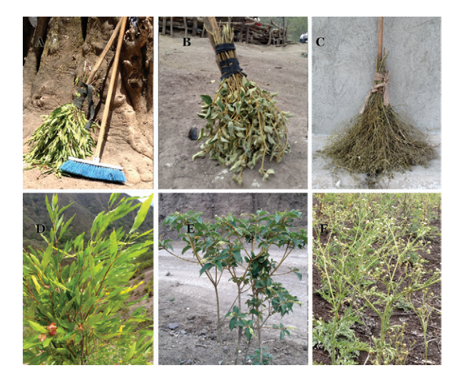
Fig. 2: species of bushes believed to have natural insecticide properties and used as brooms by positive deviants. A-D: chamana ( Dodonaea viscosa ); B-E: moshquera ( Croton sp.); C-F: florblanca or monteramirez ( Buddleja utilis ).

heat that helps them to grow better. However, none of the participants keep guinea pigs in their rooms and only two of them reported keeping them in the kitchen.