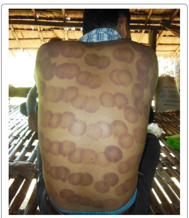
Fig. 2 Red circular marks after a session of cupping

although they were often used in combination with biomedical treatment. For almost every illness or symptom, including malaria-related symptoms, specific herbal concoctions exist based on specific plants, roots, vines or leaves. Ingredients for these concoctions are collected in the neighbouring environment (rice field, forest, gardens, etc.) by family members of the patient or provided by an indigenous healer called the kru tnam khmer (Table 1). Knowledge about such concoctions is widely spread and is passed down from generation to generation, although the elderly are perceived "to know best".