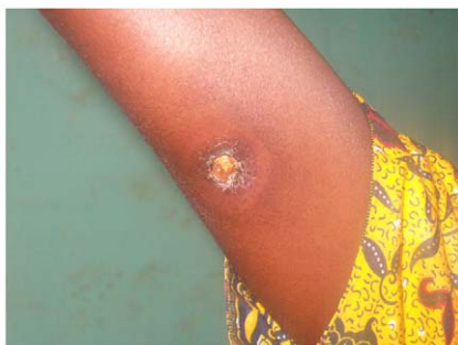
Figure 3. A simple ulcerated form of disease on the right arm. doi:10.1371/journal.pntd.0001402.g003

The median duration of hospitalization, around 90 days, was approximately similar during both periods (Table 2) and varied by disease category during the second period, respectively 60 days for category I (Figure 5 and 6), 81 days for category II, and 118 days for category III.