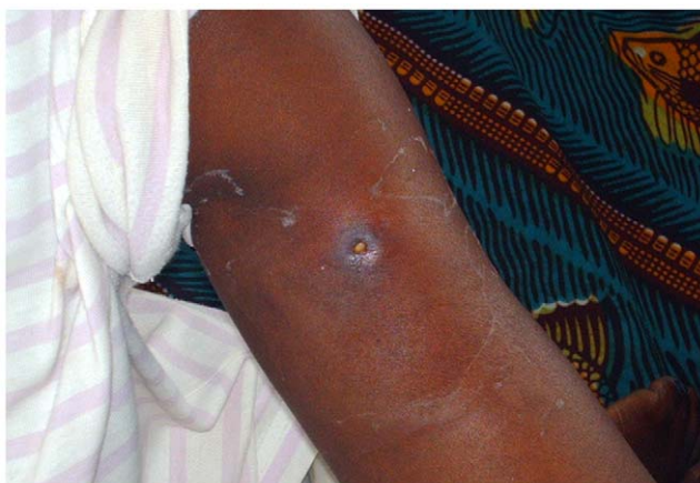
Figure 5. Single ulcerative lesion <5 cm diameter (confirmed by IS2404-PCR).

Awareness raising campaigns followed by active case-finding have contributed to the dissemination of information on BU among the communities in Songololo during the intervention period. We assume that the active case-finding activities have contributed to the change of the Male/Female ratio from 2.4/1 before the project to 1.02/1 during the project period, and thus, the project seems to have contributed to equilibrate the gender balance. During the first period, male BU patients were more frequent probably due to sociocultural barriers for women to seek