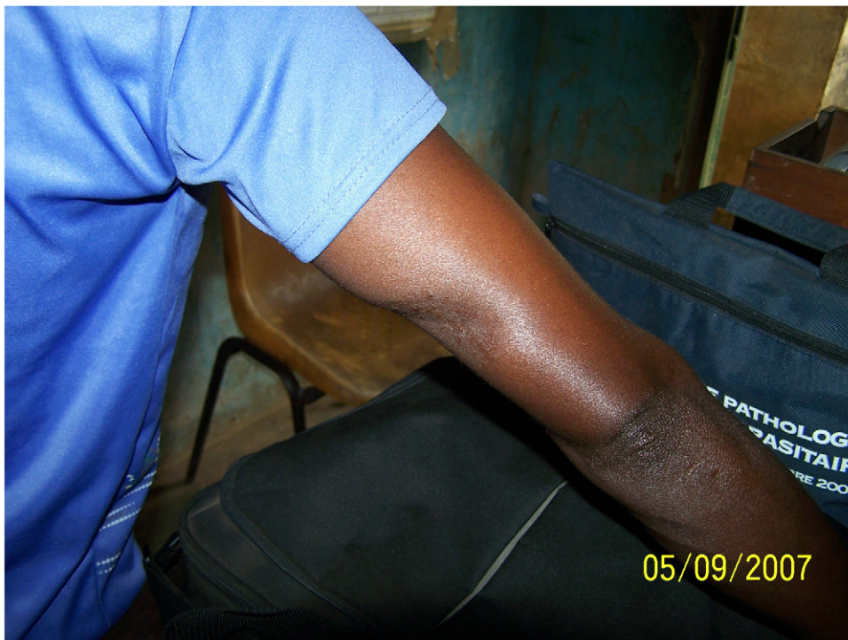
Figure 4. Healing without complications after antibiotherapy combined with surgery.