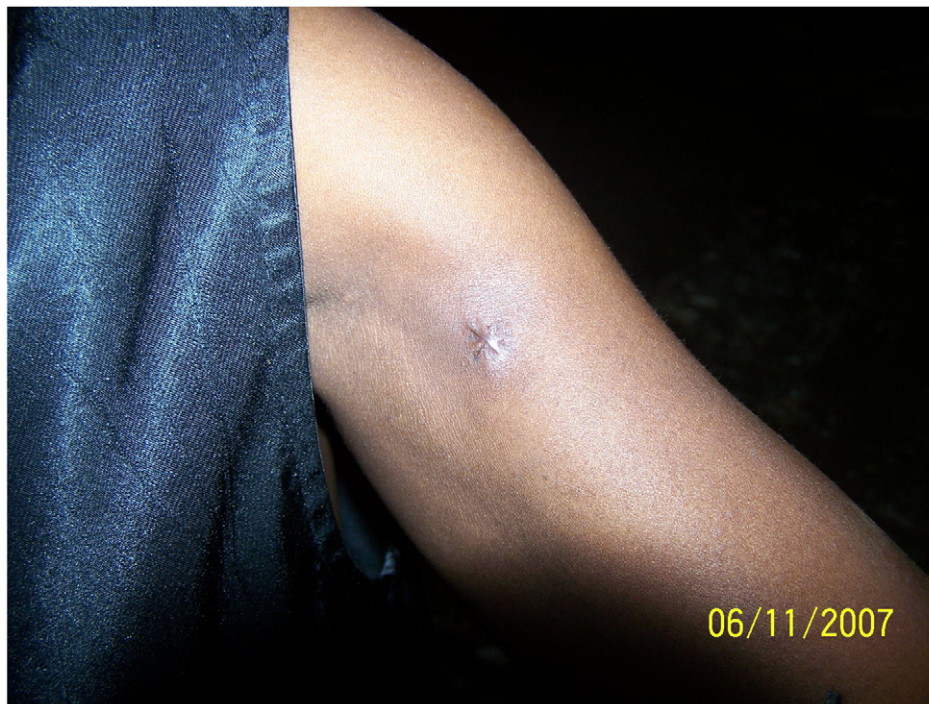
Figure 6. Healed lesion without complication after antibiotherapy alone without surgery. doi:10.1371/journal.pntd.0001402.g006

care, whereas during the second period the active case-finding activities helped the female patients to overcome these barriers.