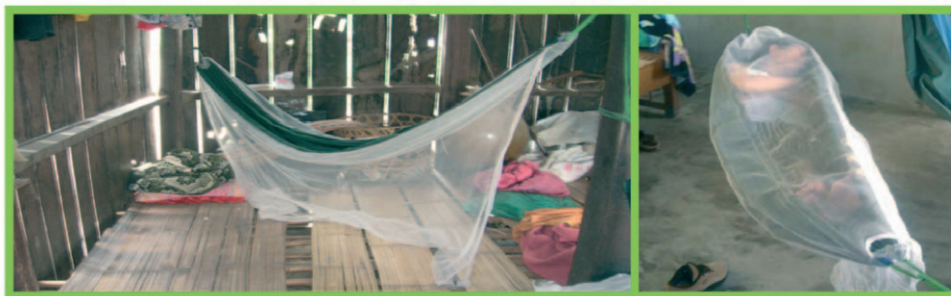
Figure 1. LLIH used for the trial. doi:10.1371/journal.pone.0029991.g001

Data collection. Qualitative data collection techniques consisted of participant observation, interviews, and group discussions. During participant observation, the researchers participated in everyday activities, observing events in their usual context and carrying out reiterated informal conversations and