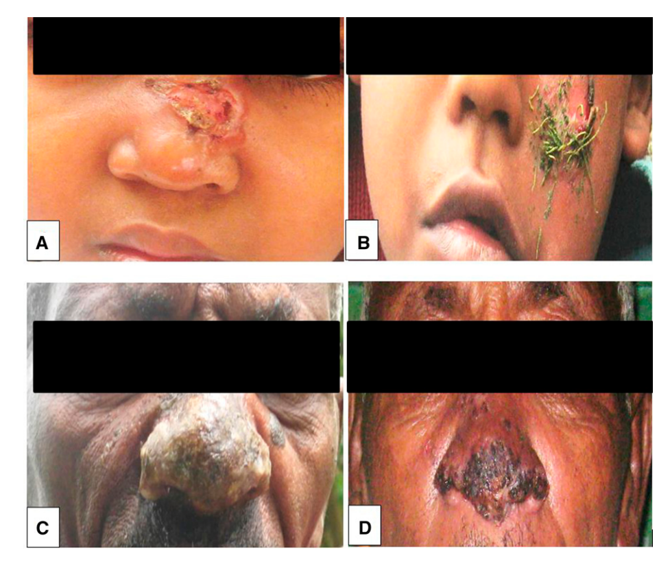
FIGURE 2. Clinical presentations of cutaneous leishmaniasis in parasitologically confirmed patients, May–July 2018, South Ethiopia. (A and B) = localized cutaneous leishmaniasis; (C and D) mucocutaneous leishmaniasis. This figure appears in color at www.ajtmh.org.

Our findings have several important public health implications. First, although the applied sampling strategy does not allow estimation of the exact burden in each village and area, this rapid