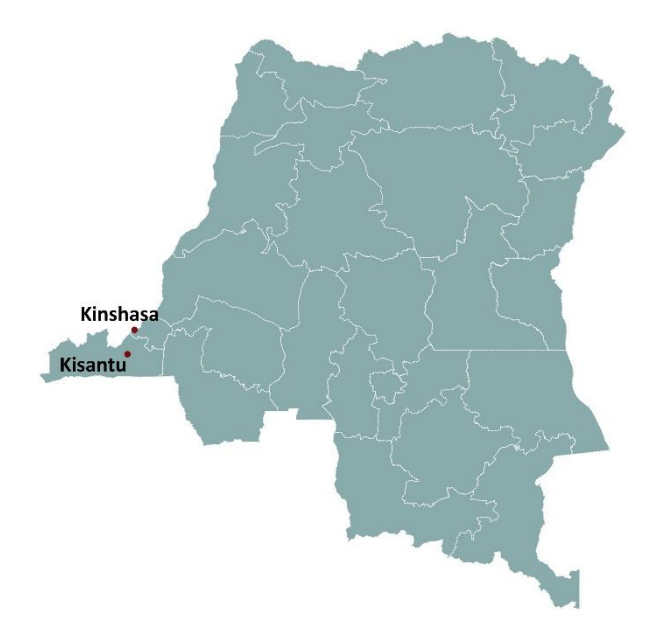
Figure 2. Geographical location of Kisantu hospital in DR Congo.

Reference Hospital St. Luc in Kisantu (further named Kisantu Hospital) is a district referral hospital located in Kongo Central Province in the Democratic Republic of Congo (DR Congo, Figure 2). The health care setting in DR Congo is characterized by its poor infrastructure and health services [8]. Kisantu has a tropical climate with average monthly temperatures up to 27 °C and an average monthly humidity up to 80% [9–11]. The local burden of Plasmodium falciparum malaria, invasive Salmonella infections, anemia and malnutrition is high in children under five-years-old [8,9,12,13]. Kisantu hospital has about 340 beds with high bed occupancy rates in the pediatric ward [14]. It is part of a national microbiological surveillance network [8,12]. Blood cultures are integrated in the routine clinical practice and sampled and worked up free of charge [8,12]. The presence of a flat hospital rate [14] and the affordability of the microbiology laboratory allows Kisantu hospital to host clinical studies [8,12].