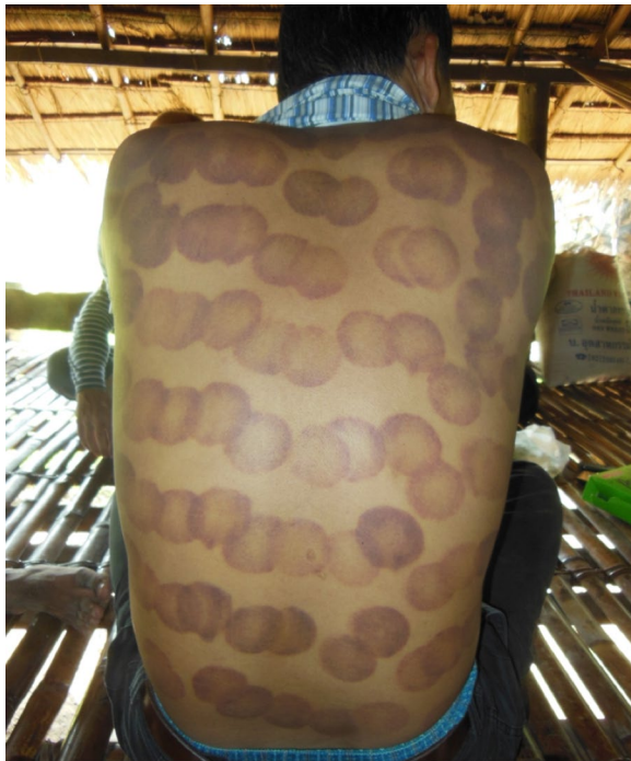
Fig. 2 Red circular marks after a session of cupping

although they were often used in combination with biomedical treatment. For almost every illness or symptom, including malaria-related symptoms, specific herbal concoctions exist based on specific plants, roots, vines or leaves. Ingredients for these concoctions are collected in the neighbouring environment (rice field, forest, gardens, etc.) by family members of the patient or provided by an indigenous healer called the kru tnam khmer (Table 1). Knowledge about such concoctions is widely spread and is passed down from generation to generation, although the elderly are perceived “to know best”.