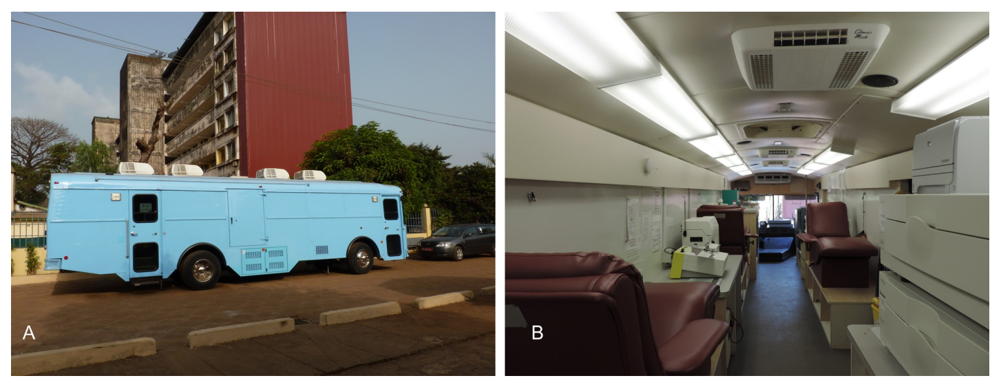
Fig 1. 'Le bus'. The exterior (a) and interior (b) view. https://doi.org/10.1371/journal.pntd.0008206.g001

The introduction of the Plasma Mobile. At the end of 2014, unexpectedly the BMGF donated a fully equipped plasmapheresis unit, located in a bus, to the Ministry of Health in Guinea. The vehicle was donated to and parked at the CNTS in Conakry (Fig 1A). It later became known in English as the Plasma Mobile, and commonly referred to in French as 'le bus'. One key stakeholder described the arrival as follows: " The bus arrived against all odds . [...] My first reaction was: these people are coming from heaven ". The introduction of the transferred technology allowed the Ebola-Tx trial to switch from CWB to CP. The trial was originally designed to use CWB but ended up using CP. Compared to other experimental treatments tested during the EVD epidemic, CWB and CP had the advantage of being locally available, in addition to the antibodies in the CWB or CP being active against the specific virus strain in circulation [46]. CP, instead of CWB, then became the preferable blood product to use as potential treatment for EVD for several reasons, including the fact that (i) plasma