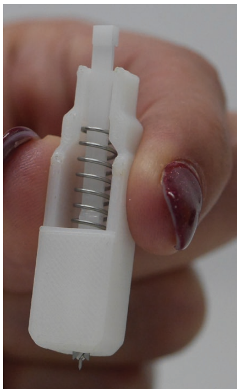
Figure 1. Picture of the microbiopsy device showing the 350- \mu m lancet and the spring-loaded plunger mechanism.

signed-rank test and the Spearman correlation coefficient, while Ct values over the different CL types were compared using the Kruskal-Wallis test.